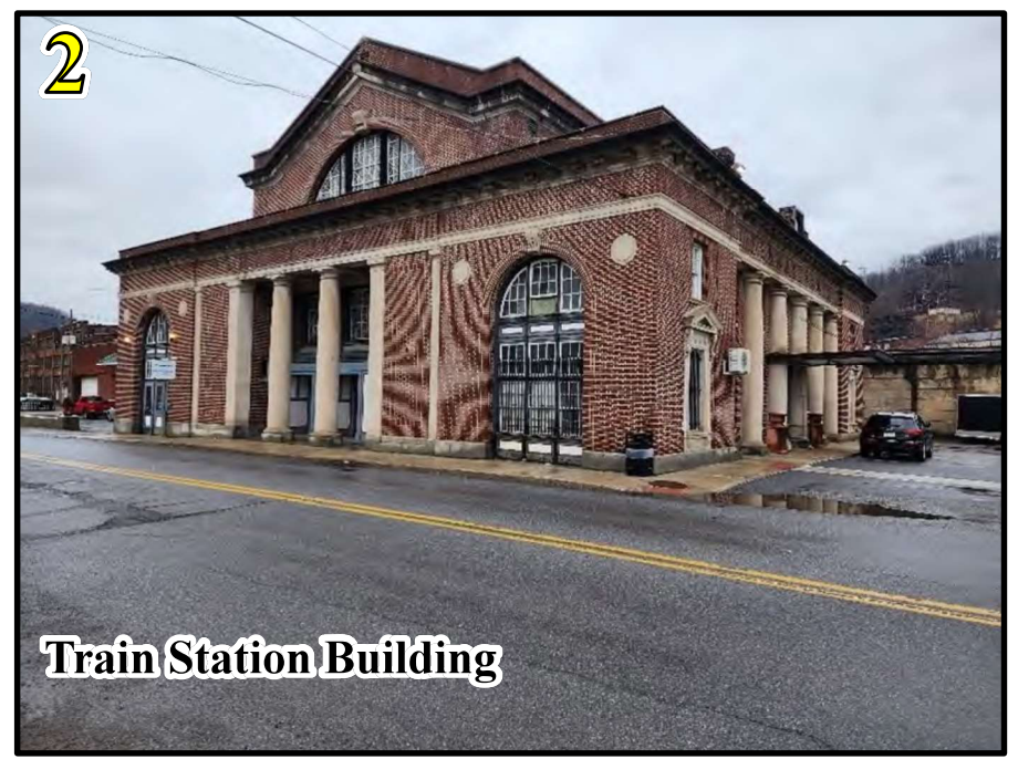
Train Station Building