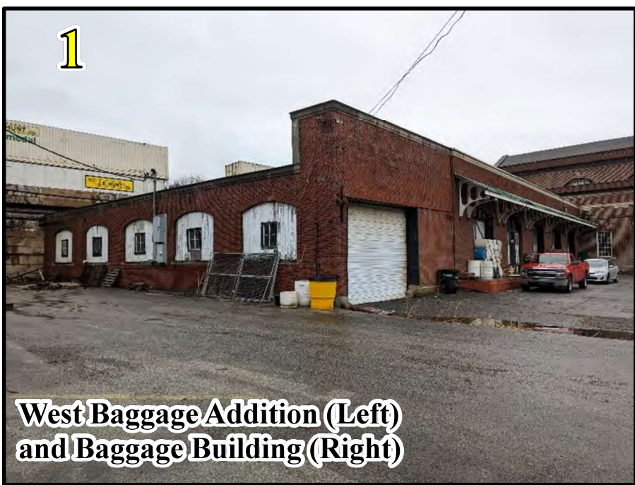
West Baggage Addition (Left) and Baggage Building (Right)

A - Train Station Building B - Baggage Building C - West Baggage Addition