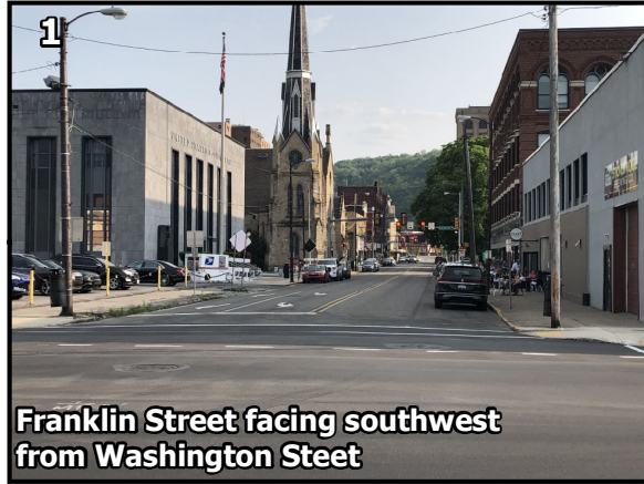
1 Franklin Street facing southwest from Washington Street