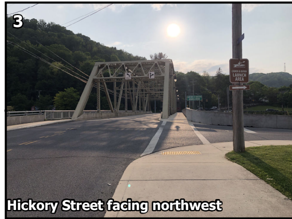
3 Hickory Street facing northwest