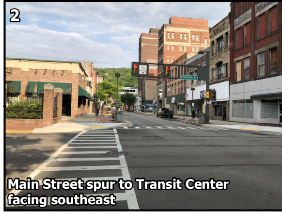
2 Main Street spur to Transit Center facing southeast